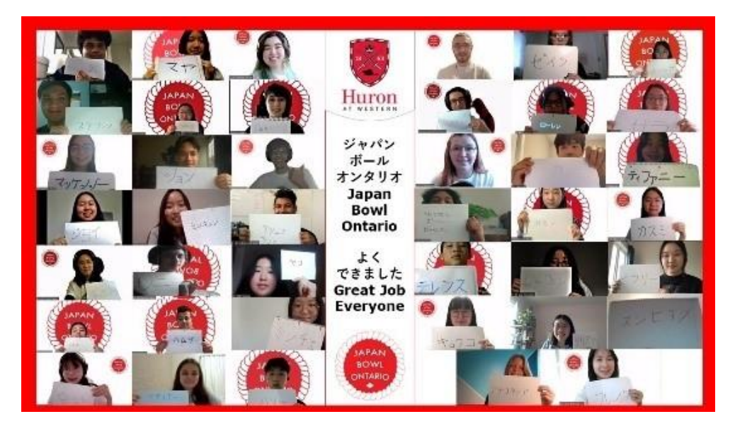
Presented by Huron University and The Japan Society

The name "Japan Bowl" is used with the permission of the Japan-America Society of Washington DC.